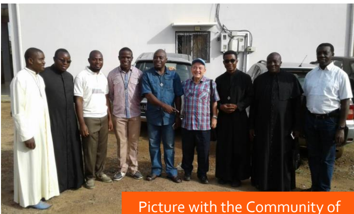
Picture with the Community of Bafia