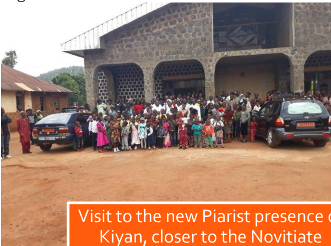
Visit to the new Piarist presence of Kiyang, closer to the Noviciate Community.