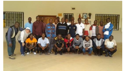
Community of Kumbo and the Novices

closer collaborators in our various institutions.