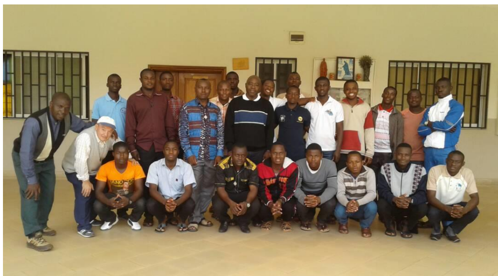
BULLETIN D'INFORMATION DE LA PROVINCE PIARISTE D'AFRIQUE CENTRALE