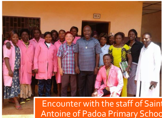
Encounter with the staff of Saint Antoine of Padoa Primary School Bamendjou.