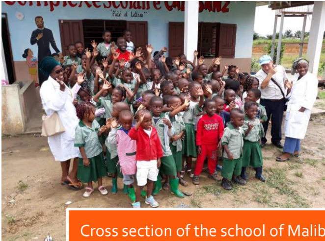
Cross section of the school of Malibe