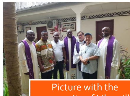
Picture with the community of Libreville

This visit to Libreville was also embellished by small visits to discover the city, a visit to the Archbishopric, another to the monastery of the Clariss Sisters at Essasa, meetings with the teachers of Calasanz College and Lay Piarists, and outings of relaxation to restaurants and other sites in Libreville. In summary, it was a very fraternal visit and very rich in experience.