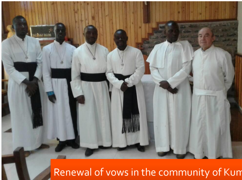
Renewal of vows in the community of Kumbo