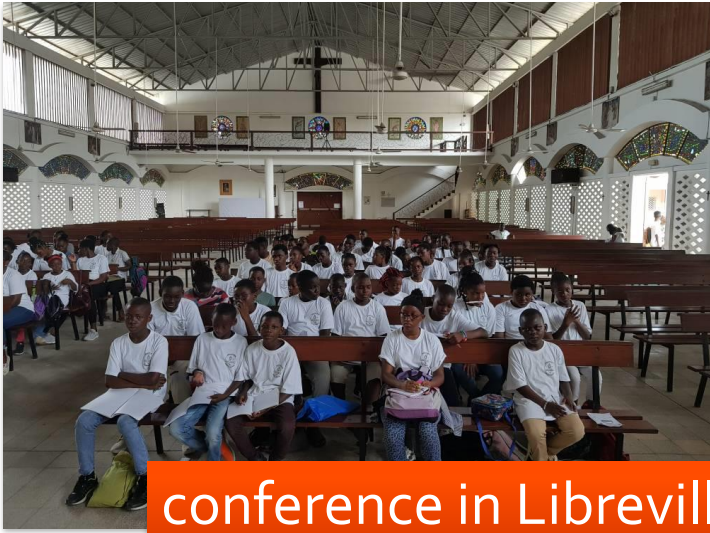
conference in Libreville