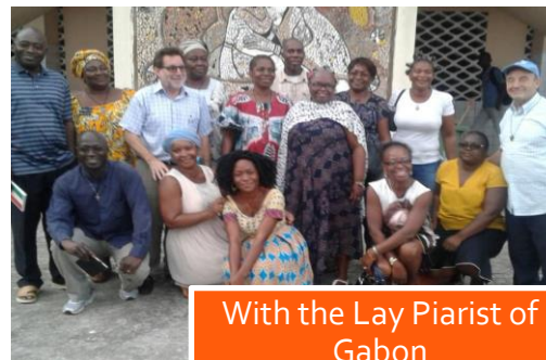
With the Lay Piarist of Gabon