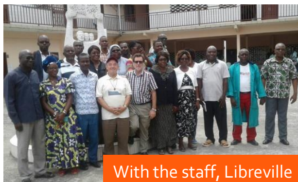
With the staff, Libreville