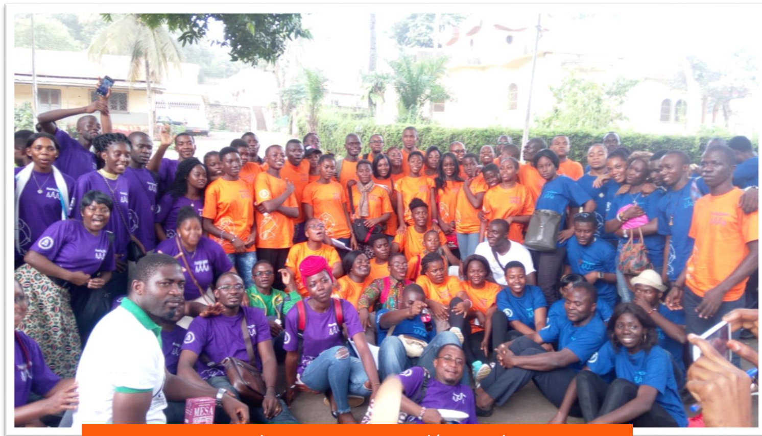
Juvenile Easter in Yaoundé, Etetak

In addition, this year, we had the participation of youths from Equatorial Guinea, coming to live this great moment of sharing, prayer and communion. This youthful Easter experience has also been experienced in our various communities across the province.