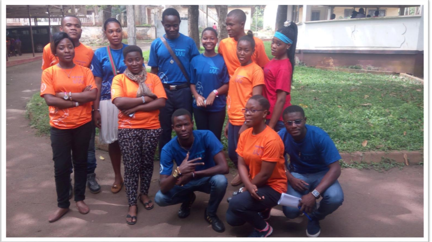
The 5th edition of Juvenile Easter in Libreville with 175 participants