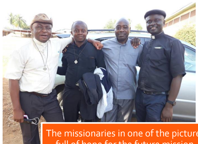
The missionaries in one of the picture, full of hope for the future mission

It was a wonderful mission that enabled us to visit some 10 parishes and several Institutions of the Diocese. We came back full of joy and thankful to God for the warm welcome that was accorded us by the Local Bishop and his Clergy. As a visionary, we remain hopeful that Nigeria remains a fertile ground for our Piarist ministry.