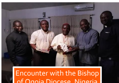
Encounter with the Bishop of Ogoja Diocese, Nigeria