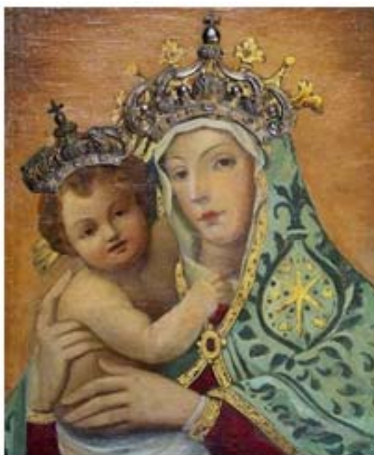
Our Lady of the Pious Schools

Calasanz gave order to build the sanctuary dedicated to the Mother of God in Frascati, where the Piarists had the first foundation outside Rome, in 1616. He brought personally the image of our Lady personally. It consists in an icon of Mary, crowned as Queen, holding tenderly her Son Jesus. Joseph urged his sons to pray constantly to Mary, for her patronage and protection is the stronghold of those loved by God.