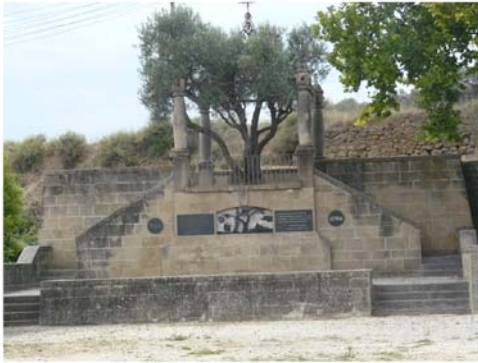
Monument to the Olive Tree