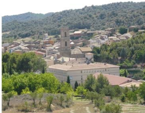
Peralta de la Sal